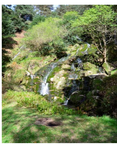
Fig. 4: Temporary stream in summer