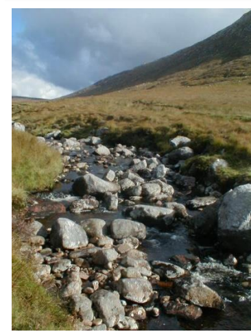
Fig. 2: Typical upland headwater stream

during certain parts of a year and ephemeral streams which typically only flow during flood events. Headwater flows arise from several different sources: seepage from soils (including peatlands), subsoils and aquifers, springs and lake outlets. Differences in geomorphic, hydrological, precipitation and ecological conditions lead to their broad instream habitat heterogeneity.