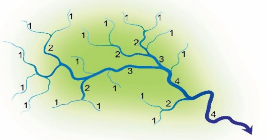
Fig. 1: Strahler stream order