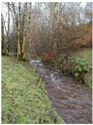
Fig. 3: Small lowland stream